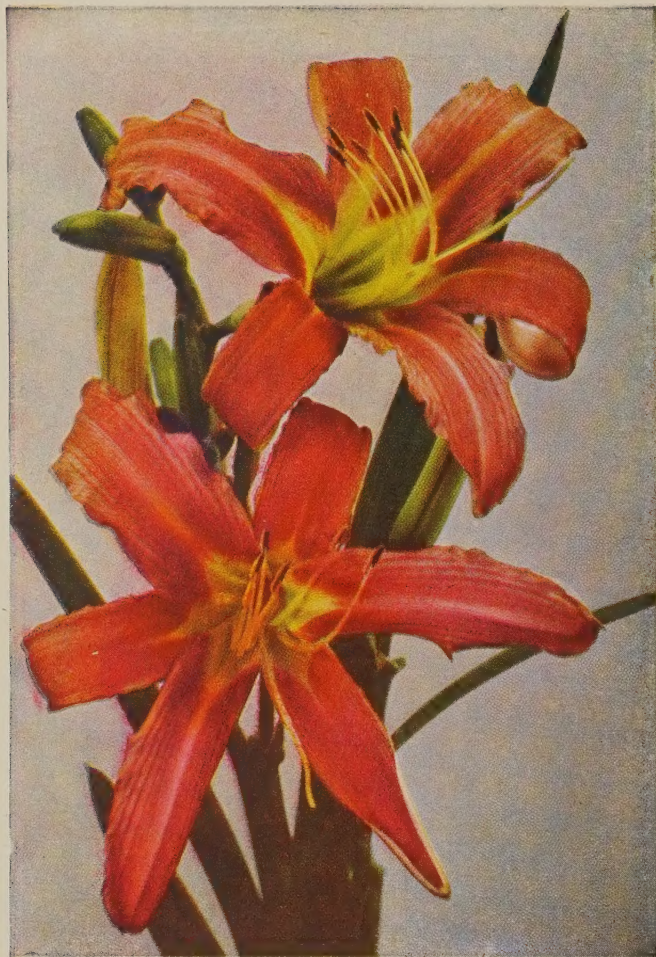
DAYLILY FULVA ROSEA

We are now listing the finer and better daylilies. displays of the newer